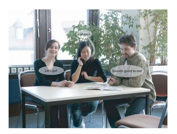
Figure 1: Mockup of a possible user interface.

The information needs to be presented through an intuitive and non-obtrusive interface. The interface itself must not inhibit the user in any way or interfere with his everyday tasks. This precludes the use of complex and graphics-heavy interfaces. A major part of the interface design will be the visual representa-