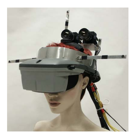
Figure 4: Experimental AR System with audio tracking.

and virtual objects are combined and presented to the user in a head mounted display (HMD).